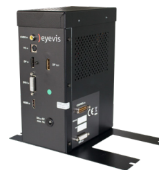
Inputbox for EC-2004 (optional)

All electric, optical and electronic components as well as the cooling system are integrated completely into a closed projection unit including a network interface and colour control (ACT-internal). This unit can be inserted into or removed from the cube housing in a few simple steps. This speeds the setup and reduces the downtime during maintenance. Through an optional inputbox the cubes from the 2004 series can be equipped with additional connectors for inputs and outputs, and an internal matrix controller.